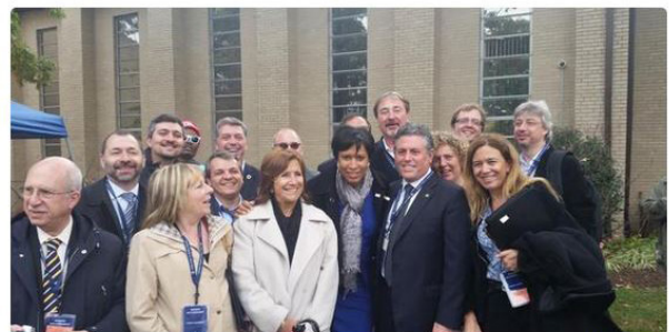
D.C. Mayor Muriel Bowser greets a USEP delegation from Argentina.

IFES retweeted MurielBowser @MurielBowser · Nov 4 Argentinian delegation @IFES1987 observing DC's proud Democratic process! #USEPIFES #WeDoVote