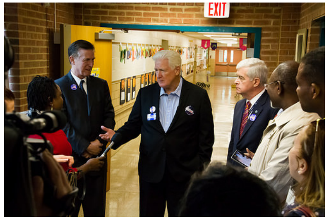
Congressman Jim Moran (D-VA) and then-Congressional candidate Don Beyer (D-VA) meet with USEP participants and media.