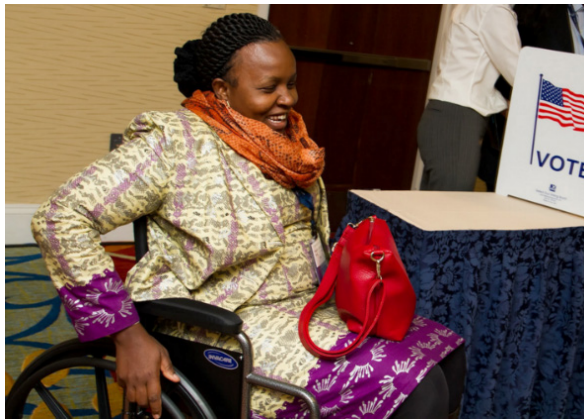
A participant in the 2014 USEP simulation on accessibility for voters with disabilities.