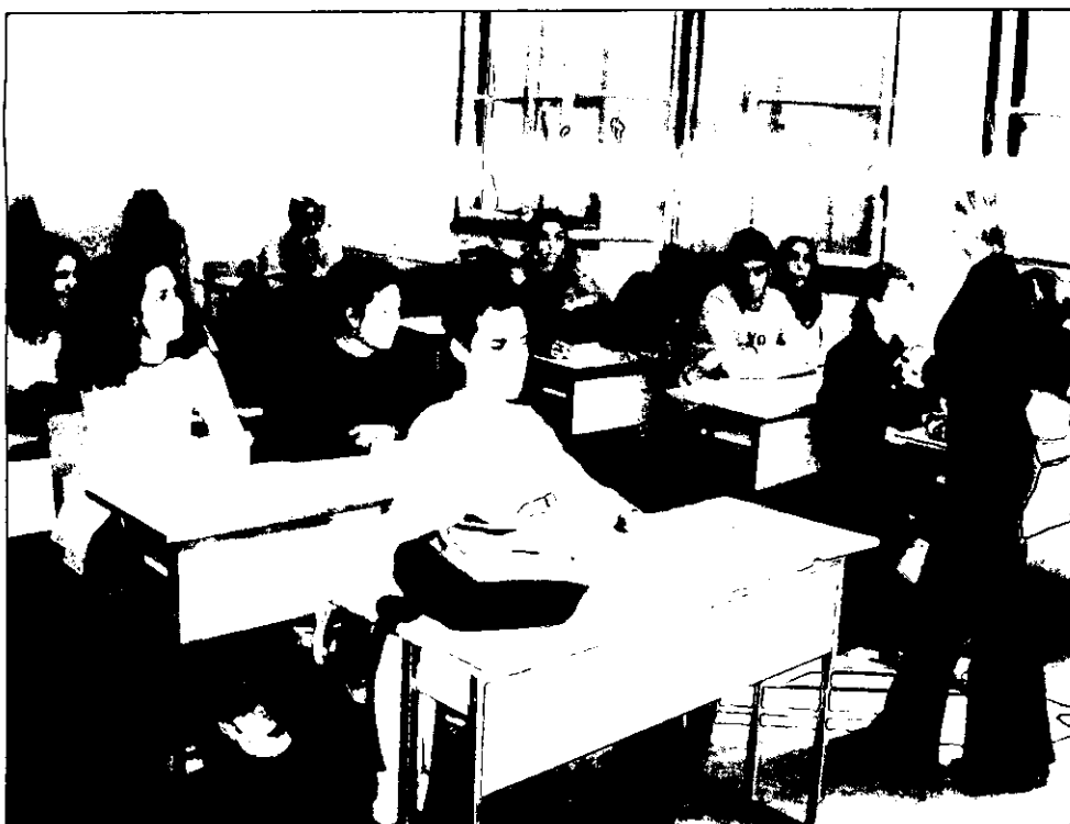
Maturanti 4.d na GONG-ovoj radionici