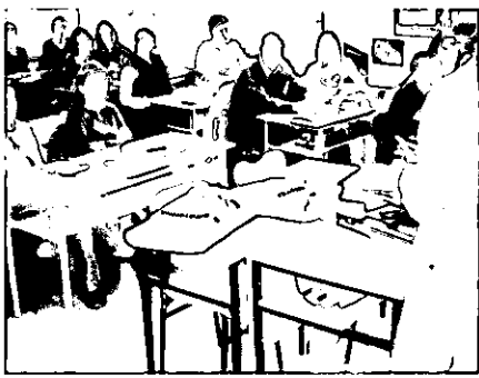
• Workshop in High school in Slavonski Brod, October 13, 2003

During this school year we have conducted "I vote for the first time" workshops in 219 out of 365 high schools in the Republic of Croatia. 818 workshops were held in the first term, from October 13th to December 19th, 2003. 46 trainers conducted the workshops. More than 21 500 high school seniors attended the workshops, which is 45% of the total number of high school seniors in the Republic of Croatia.