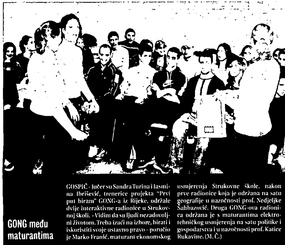
GONG među maturantima

The project was evaluated as extremely successful, especially its organization, and all persons who participated in the project expressed their satisfaction with the results that were achieved and the work they did. Trainers/lecturers made only two recommendations - not to give out condoms next year; and not to use the chart number three, To Vote and be Voted For because it is unnecessary.