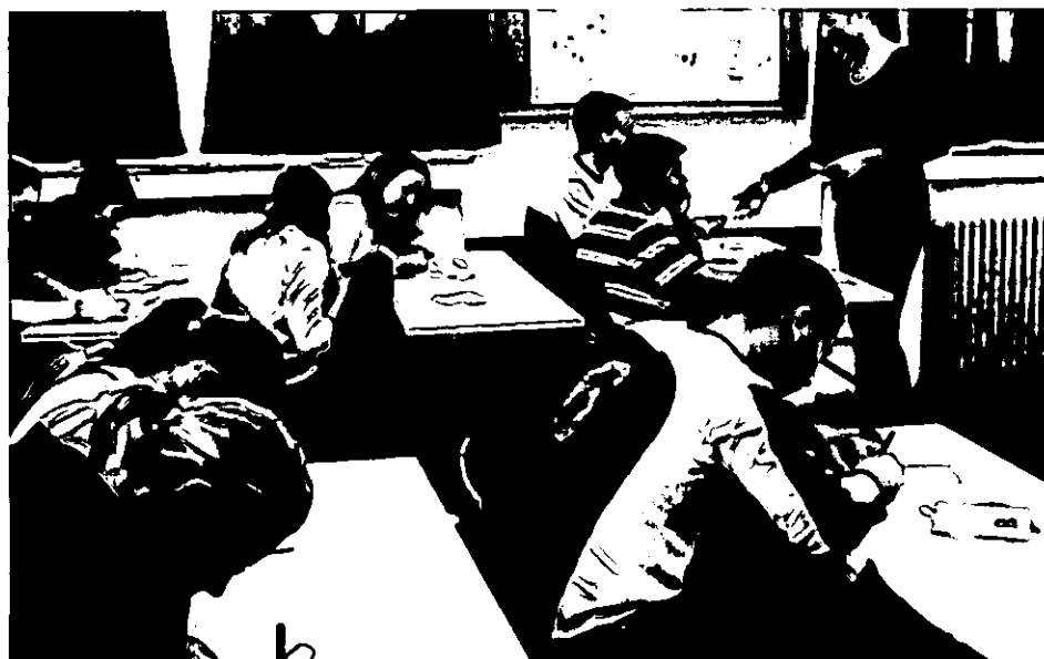
• Workshop in Economic school in Zagreb, September 25, 2003 (Pilot workshop)

We started conducting workshops on October 13th, 2003, and since the parliamentary elections were to be held on November 23rd, all schools wanted the workshops to be held by that date.