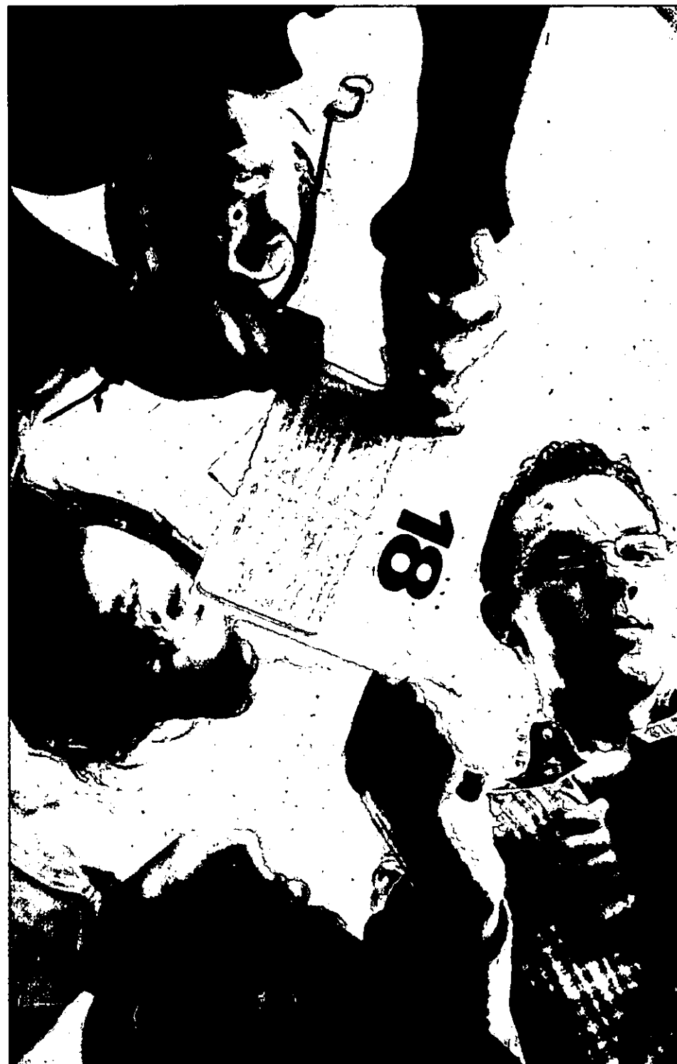
• High school seniors after “I vote for the first time” workshop with “Finally 18” brochure

After every workshop students would write down their impressions on a piece of paper, and their teachers would fill in a questionnaire about their impressions, and they were later used to evaluate the workshop.