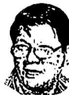
RENATO S. DE VILLA

Senatorial Slate TEOFISTO GUINGONA / ROBERT BARBERS / RICARDO GLORIA ROBERTO DE OCAMPO / RAMON REVILLA / ROLANDO ANDAYA HERNANDO PEREZ / RENATO CAYETANO / ROBERTO PAGDANGANAN SANTANINA RASUL / LISANDRO ABADIA / LOREN LEGARDA