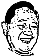
JOSE C. DE VENECIA, JR.