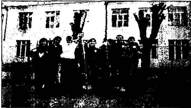
Kutaisi, Samtredia (Imereti Region)