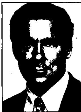
Thomas M. Davis III Republican — incumbent

BIOGRAPHY: Occupation: member, United States House of Representatives, 11th District Virginia; chairman — District of Columbia Subcommittee, House Government Reform and Oversight Committee; member, House Transportation and Infrastructure Committee. Education: Amherst College, political science; University of Virginia, law. Experience: chairman, Fairfax County Board of Supervisors; vice