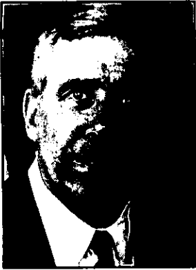
Frank R. Wolf Republican — incumbent

BIOGRAPHY: Elected to Congress 1980. Re-elected 1982, 1984, 1986, 1988, 1990, 1992, 1994, and 1996. Member, House Appropriations Committee, subcommittees on transportation (chairman), treasury, and foreign operations; Helsinki Commission; Human Rights Caucus. Former deputy assistant secretary, congressional, legislative affairs, Interior Department. Attorney. LL.B., Georgetown Law School,