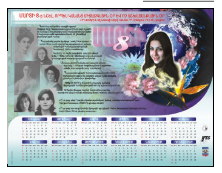
The commemorative 2001 International Women's Day calendar distributed by IFES and the WRC to promote broader public awareness of the Women's Day holiday among the Armenian public.