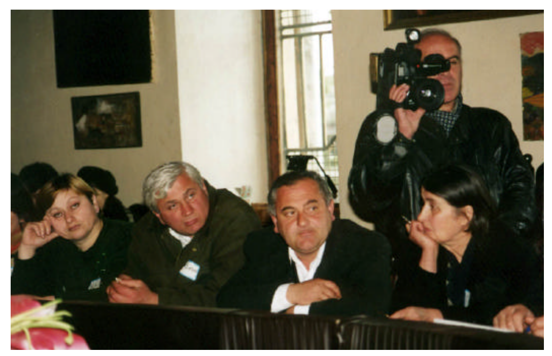
IFES/Georgia facilitates civic education roundtable in Kutaisi, Georgia.

the NGOC, joined with IFES to sign a Memorandum of Understanding (MOU). This memorandum outlines the responsibilities of each organization and provides for a transparent framework for drafting the new election code. Under this framework. IFES is facilitating weekly working sessions of the PWG and CNGO, and will be providing technical support to the team of lawyers tasked with the actual drafting the code.