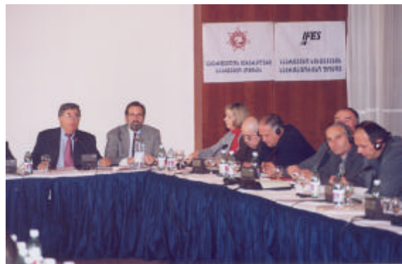
Craig Donsanto and Barry Weinberg, U.S. Department of Justice, participated in a series of workshops designed to clarify election adjudication procedures.

From 7-11 March, IFES/Georgia held a series of roundtables and workshops aimed at clarifying the judicial and administrative procedures for adjudicating election complaints. In collaboration with the Judicial Training Center, IFES hosted roundtables with justices of the Supreme Court and with rayon judges. IFES and the CEC conducted workshops