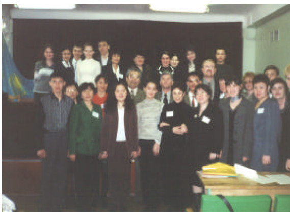
Participants of the Student Olympiad and Teacher's Conference at the awards ceremony held on 31 March in Almaty

The Olympiad consisted of a written test dealing