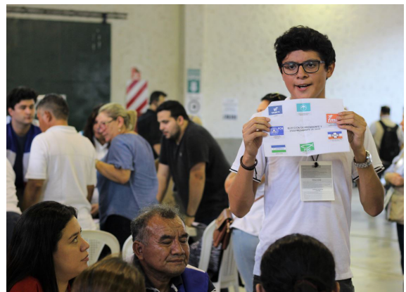
During the vote count, poll workers should show each ballot to observers and party agents from a distance.

Where poll workers count paper ballots in polling stations, several adjustments to the common process should be made to ensure their safety. One consideration is the desk space required for counting ballots while maintaining physical distance among the scrutineers. As party agents and observers are also to perform their duties during this critical part of the results process, each individual ballot should be shown to them, without allowing them to touch it, before being placed in its respective pile. This will increase transparency but also