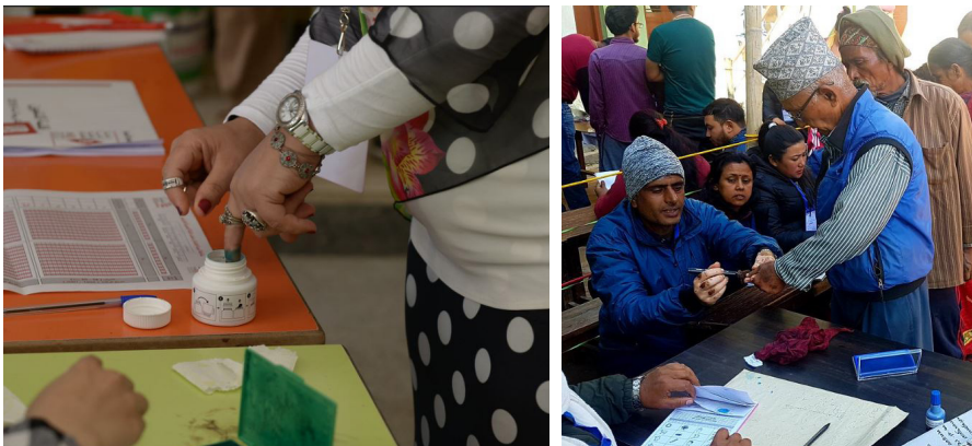
Indelible ink can be applied by the poll workers or by voters directly. Applicators that reduce the need for human-to-human contact should be preferred.

also require that voters touch screens or buttons, so EMBs must learn how to sanitize the equipment without damaging it or use disposable protective film or other translucent material to avoid direct contact with these surfaces.