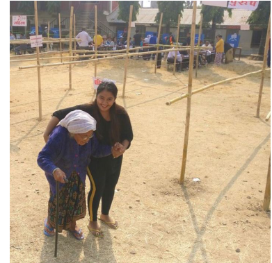
A woman receives assistance to vote in Nepal. Physical distance requirements cannot always be followed during assisted voting and PPE is recommended

Some voters, especially those with disabilities, may require assistive devices or assistance from another person to cast their ballots. If headphones, tactile ballot guides or other assistive devices are used to help voters with disabilities vote independently and secretly, this equipment or material should be properly sanitized after every voter who uses it. When the assistance of another person is requested, the required physical distance most likely cannot be followed, and both the assistant and the voter should wear PPE like face masks or shields and sanitize their hands before and after the ballot is cast.