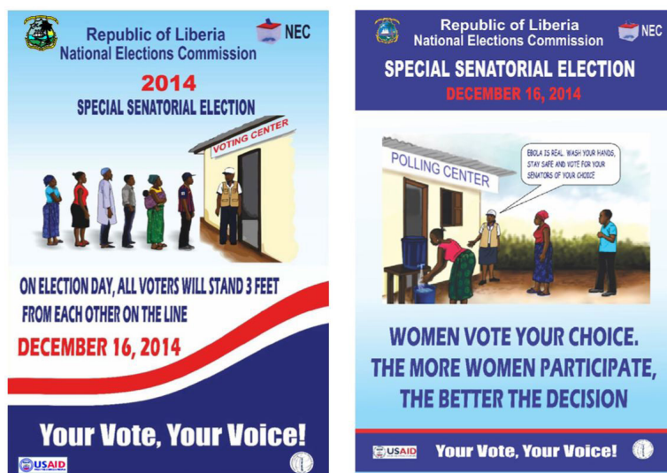
Examples of voter education materials from Liberia during the 2014 Ebola outbreak.