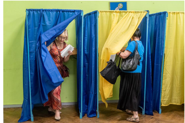
Although curtains help keep the secrecy of the vote in Ukraine, they should be avoided during the COVID-19 crisis to reduce the chance of virus transmission.

The layout inside each polling station also must be carefully planned. The placement of the tables and the seats for poll workers should respect the required physical distance, and officials should control the flow of voters at each stage of the polling process to avoid person-to-person contact and allow time for sanitization of any equipment. EMBs should also consider eliminating any steps that might lead to unnecessary touching of objects. For instance, EMBs might prefer buildings with fewer doors or doors that open and close automatically to avoid handling of doorknobs and using fixed booths rather than curtains to avoid voters touching the cloth. Multiple-person seating, especially benches and side-by-side chairs, should be removed, and the polling place should have as few unnecessary objects and surfaces as possible. If available, plexiglass or other translucent shields can be installed in polling tables to add a protective barrier between poll workers and voters and help block viral droplets from being transferred from one person to another. These shields should be frequently disinfected.