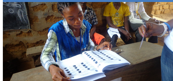
During the 2014 Ebola crisis in Liberia, pollworkers are careful to have contact-free voter check ins.

At the height of the Liberian Ebola epidemic, IFES worked with the National Election Commission and medical experts to integrate practical health and safety measures such as social distancing and revised processing of voting material. During poll worker training, IFES focused on queue control and voter temperature testing. We also supported an aggressive voter education effort that built upon a public health campaign, which proved critical to changing behavior. As a result, the election proceeded safely, and Liberia's democracy, at a critical stage, progressed.