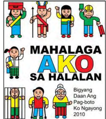
TF2010 Voter Registration Materials which reads, "I am important in elections. Give us access to participate in the 2010 elections"

The work of the Task Force was guided by three basic principles: (1) respect for the sanctity of the ballot, (2) engagement of voters in the process, and (3) enforcement of political rights and liberties as protected under the Constitution. Through its activities, the Task Force hoped to motivate citizens, particularly youth aged 18-35 who will make up approximately 60% of voters in 2010, to become more actively involved in the electoral reform process and preparations for the 2010 national and local elections.