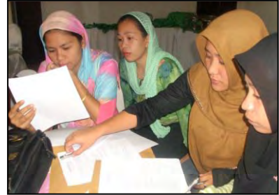
CCARE volunteers training to observe elections

Through Citizens CARE's "Strengthening Election Process through Voters Education and Election Monitoring in the Autonomous Region in Muslim Mindanao" (SEPVEEM), Citizens CARE continued to empower disadvantaged community members with knowledge and skills that enabled them to actively participate in decision making processes and exercise their right to suffrage responsibly. This was done by applying three modes of intervention: Pulong Tayo/PT (Let's Meet), Ugnayan Tayo/UT (Let's Link Up), and Election Monitoring.