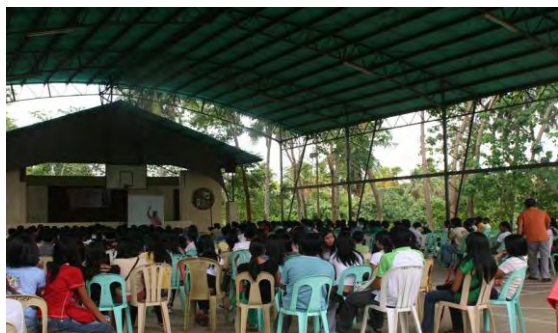
A Bantay Eleksyon seminar, which included a Citizen-Voter Education session and the Bantay Eleksyon 2010 recruitment orientation conducted before 400 Social Science students of the University of South-Eastern Philippines (USEP) in Davao City, Southern Philippines.