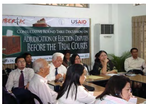
Trial court judges, election lawyers from the Commission on Elections, House of Representatives Electoral Tribunal, Senate Electoral Tribunal and private lawyers for candidates join a round table discussion on the Election adjudication disputes before trial courts last January 2009.

This event, hosted by LIBERTAS on 3 June 2009, generated discussion on election adjudication in the context of the May 2010 automated election. Representatives of COMELEC and the various election adjudication courts and tribunals, election attorneys, and electoral reform groups attended. During the