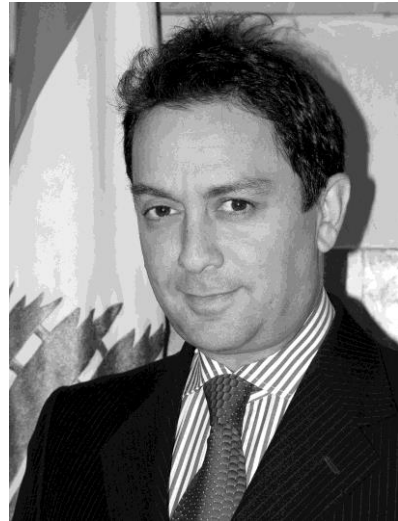
Ziad Baroud Former Minister of Interior and Municipalities, Lebanon