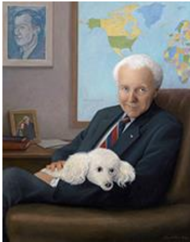
| Hon. Tom Lantos | (D) - California