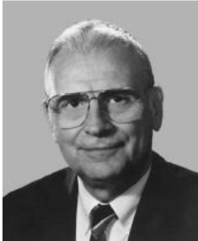
| Hon. Lee H. Hamilton | (D) - Indiana