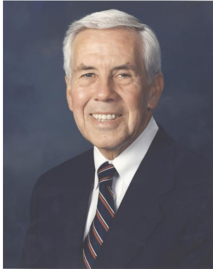
| Hon. Richard G. Lugar | (R) - Indiana