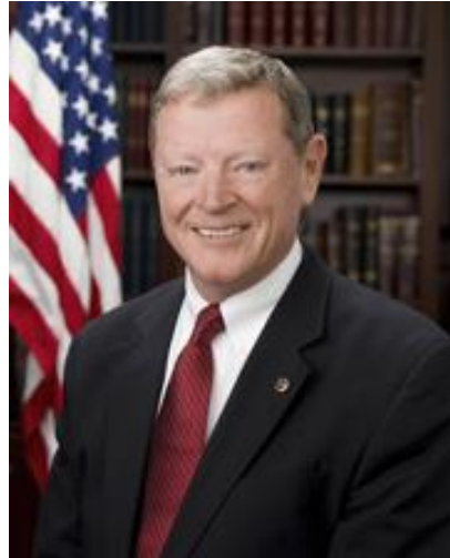
| Hon. James Inhofe | (R) - Oklahoma