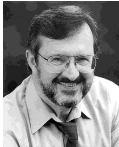
| David Obey | (D) - Wisconsin