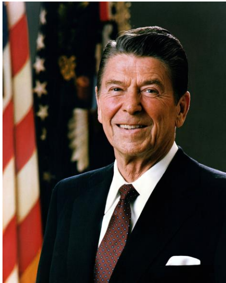
| H.E. Ronald Reagan | 40 th President of the United States